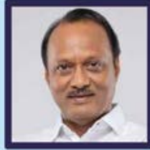
Shri. Ajit Pawar Hon'ble Deputy Chief Minister