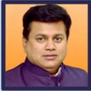
Shri. Uday Samant Hon'ble Minister Higher & Technical Education