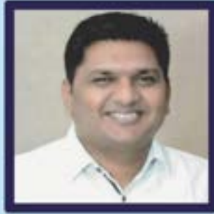
Shri. Prajakt Tanpure Hon'ble Minister of State Higher & Technical Education