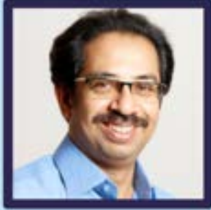
Shri. Uddhav Thackeray Hon'ble Chief Minister